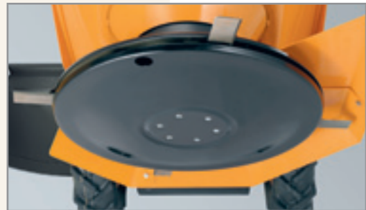
Stable rotary mower disc with 4 swinging blades.