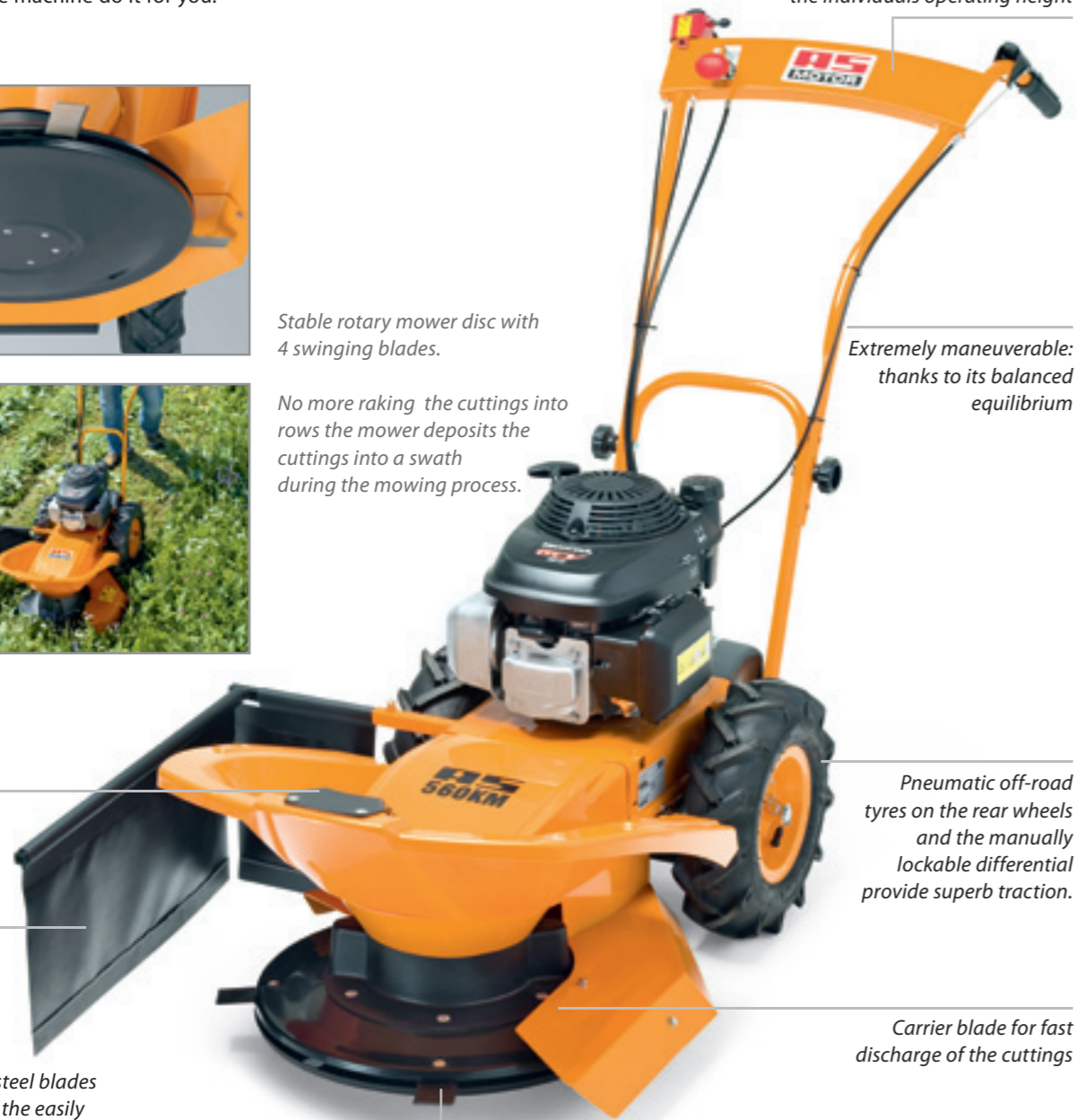
The handles can be adjusted to the individuals operating height