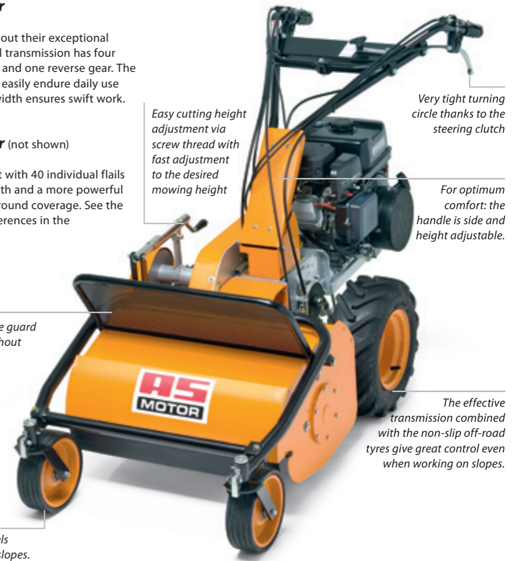
Easy cutting height adjustment via screw thread with fast adjustment to the desired mowing height