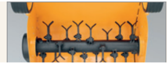
Adjustable cutter mechanism with swing mounted individual flails

similar to the AS 570 but with 40 individual flails and a 70 cm cutting width and a more powerful engine for even more ground coverage. See the data table for other differences in the specifications.