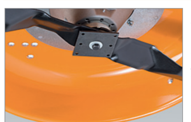
The AS 510 Mulching Unit:

stable mulching dome, additional reinforced blade bearing and mulching blade made of spring steel. These components provide for finely chopped mulch that remains on the surface, thus fertilising the lawn in a natural way.